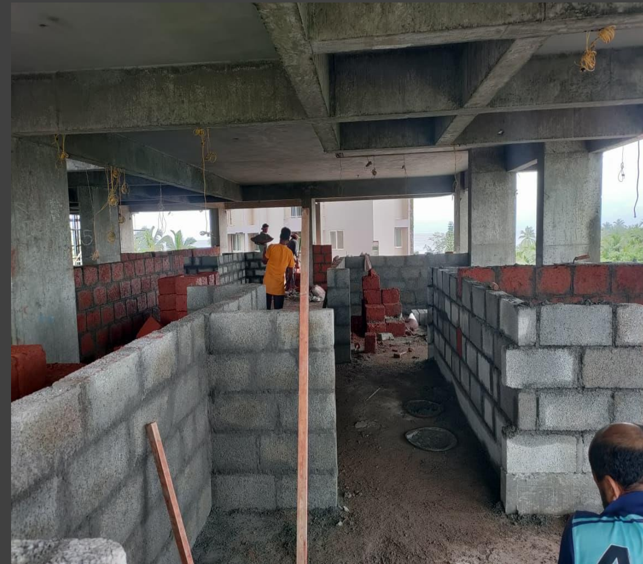
FOURTH AND FIFTH FLOOR MASONRY WORK