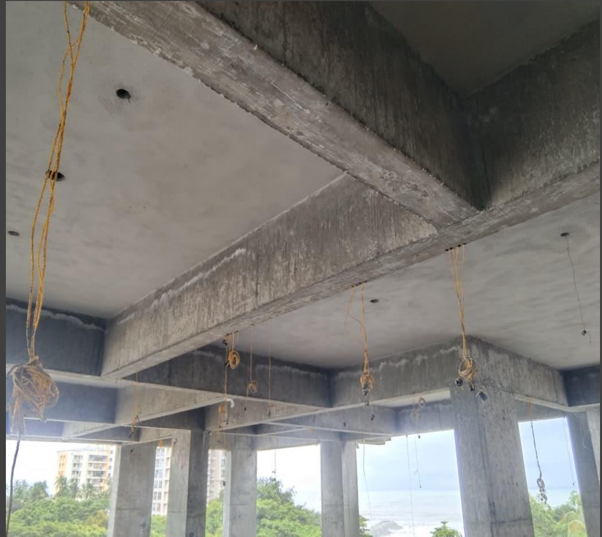
EIGHTH FLOOR CEILING PLASTERING