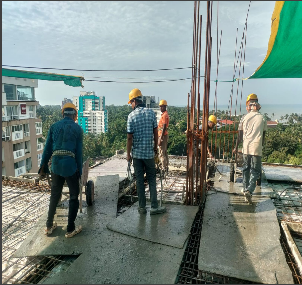
TWELFTH FLOOR SLAB RCC