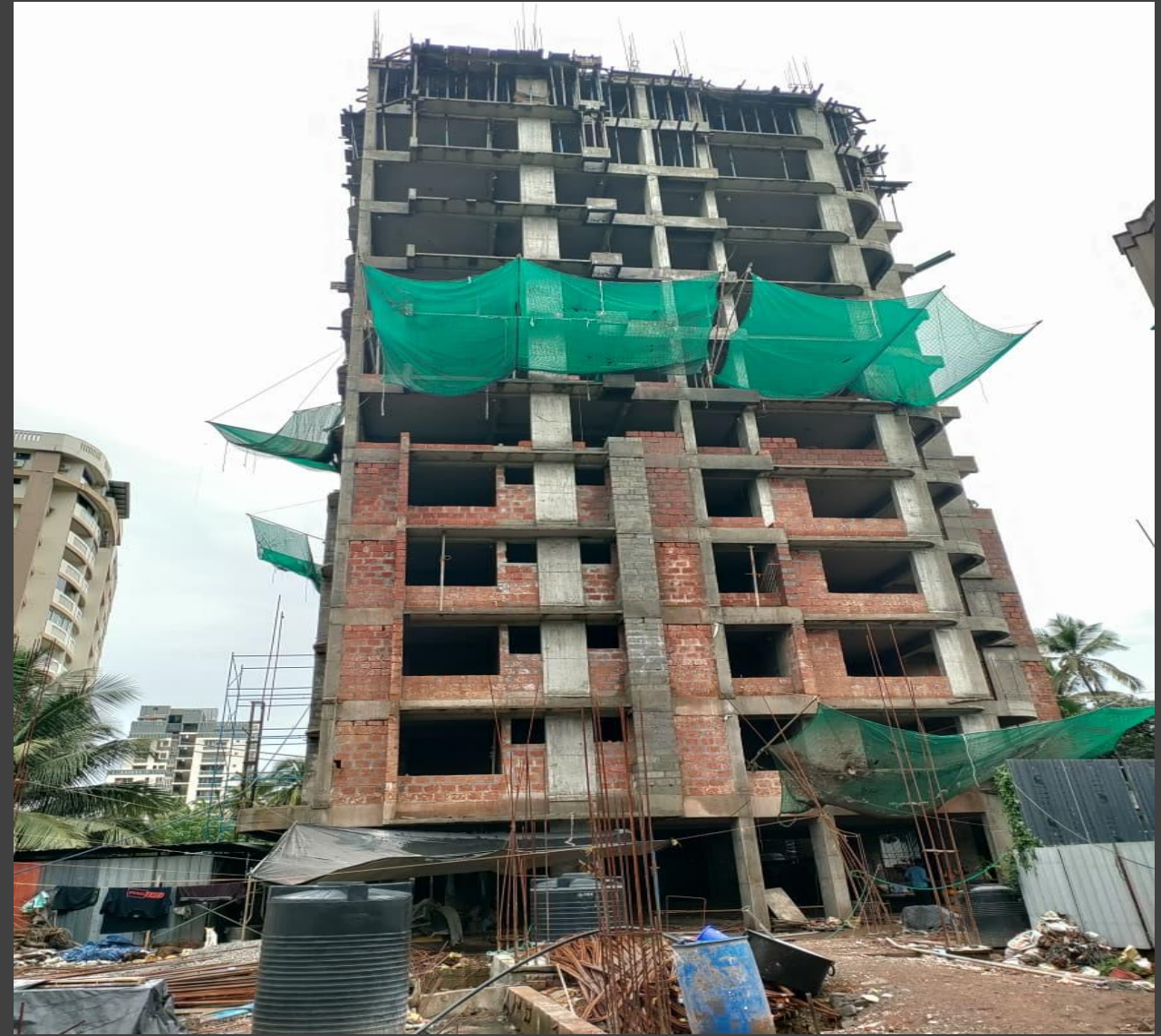
FRONT & REAR ELEVATION